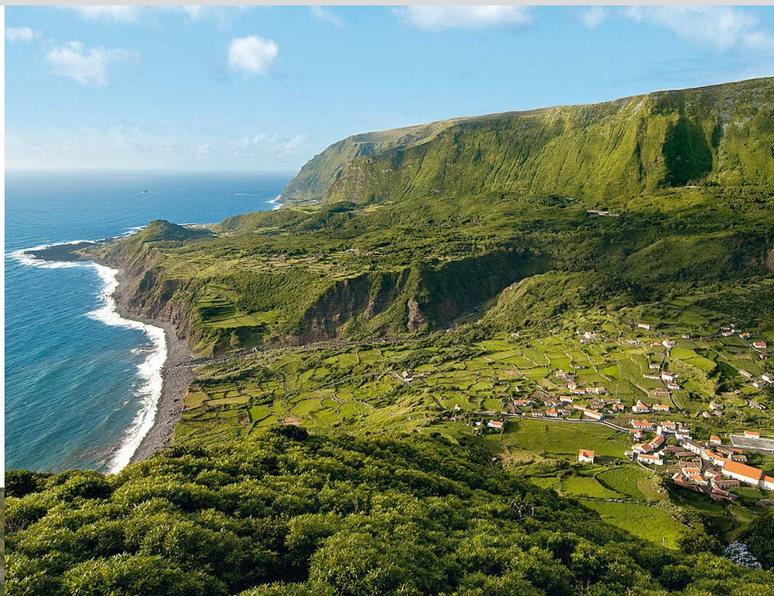
Fajãzinha on Flores' dramatic west coast.

ancient cart track to ascend and, 15 mins later, at the old watermill, Moinho da Ribeira da Alagoa (10) , merge into the main road to Fajã Grande (3 hrs 45 mins).