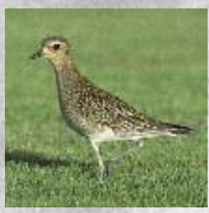
When they return.

golden plover, this tiny bird flies over 2,500 miles nonstop to Alaska every year for the summer, returning to Hawai'i after mating. Some of these birds continue past Hawai'i and fly another 2,500 miles to Samoa and other South Pacific islands. The early Polynesians surely must have noticed this commute and concluded that there must be land in