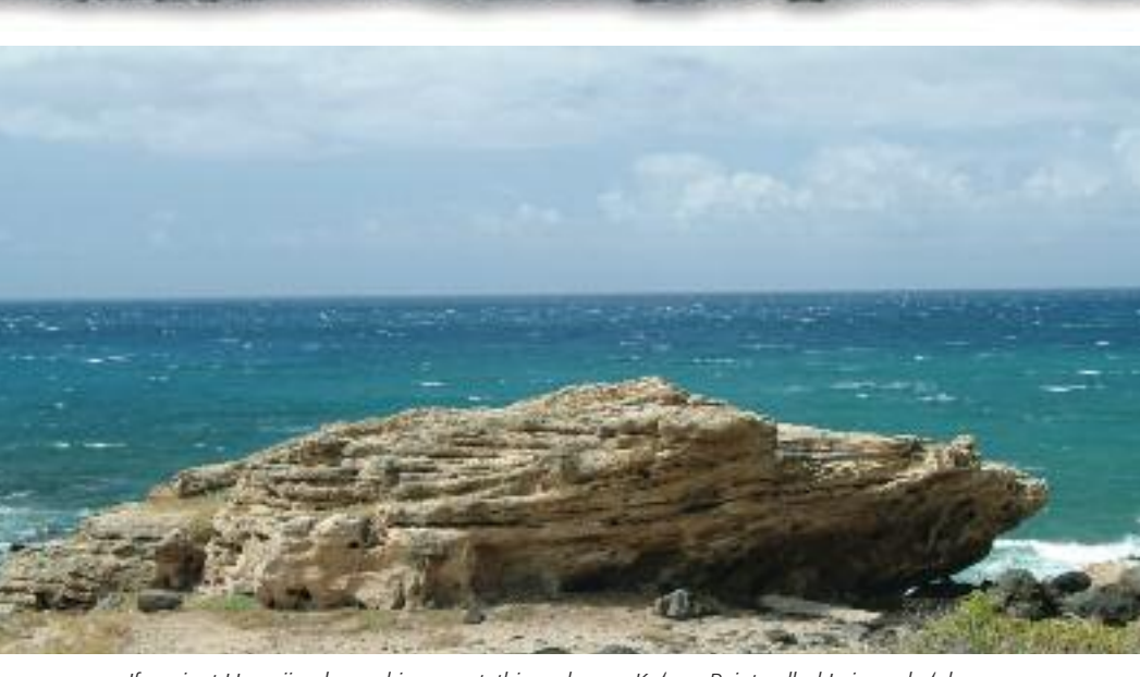
If ancient Hawaiian legend is correct, this rock near Ka'ena Point called Leina-a-ka'uhane the leaping place for souls—is the last earthly sight that a Hawaiian soul will see before he joins his ancestors.

and the penalty for breaking one was usually death by strangulation, club or fire. If the violation was serious enough, the guilty party's family might also be killed. It was kapu, for instance, for your shadow to fall across the shadow of the ali'i. It was kapu to interrupt the chief if he was speaking. It was kapu to prepare men's food in the same container used for women's food. It was kapu for women to eat pork or bananas. It was kapu for men and women to eat together. It was kapu not to observe the days designated for the gods. Certain areas were kapu for fishing if stocks became depleted, allowing the area to replenish itself.