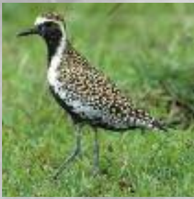
Before they leave for Alaska.

Given the remoteness of the Hawaiian Islands relative to the rest of Polynesia (or anywhere else for that matter), you'll be forgiven for wondering how the first settlers